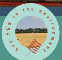
Image courtesy of Daily Mail article - How CAN this be a green scheme.

Part of Sunnica scheme around Elms Rd. Total scheme area is ca. 10x bigger than this.